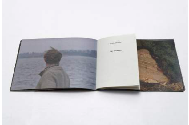
“Une aventure” catalog published by the Centre international d’ art et du paysage. A catalog was published for the exhibition, including an unpublished text commissioned by Bertrand Scheffer and images of Rebecca Digne’ s film shot on the island of Vassivière. Graphics: Adrien Aymard