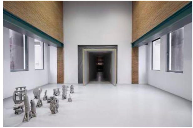
Rebecca Digne, A perdere , 2017 Set of sculptures from the A perdere series Ceramic, sand, rope, wax