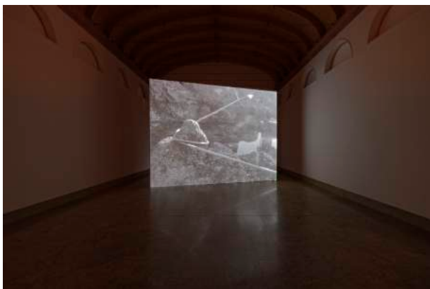
Rebecca Digne, Tracer le vide, 2017 Digitally transferred Super 8 and 16 mm film Colour and black & white 8 min