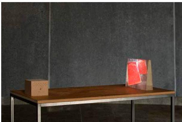
Rebecca Digne, Rouge, 2014 HD video/16mm and Super 8 film.

Visuals in 300 dpi available on request Tel. +33 (0)5 55 69 27 27 communication@ciapiledevassiviere.com