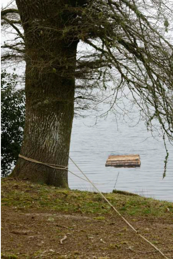
Rebecca Digne, Radeau, 2018 Raft made during the film « Une aventure » which is connected to the Art Centre by the rope of the film « Tracer le vide »