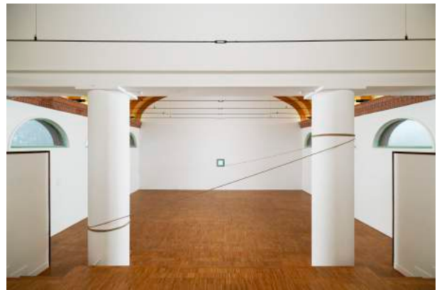
Rebecca Digne, Radeau , 2018 Installed with rope used in Tracer le vide , this rope is used to attach a raft (that floats on the lake of Vassivière) to the Art Centre. Coproduction Centre international d'art et du paysage and Sertis