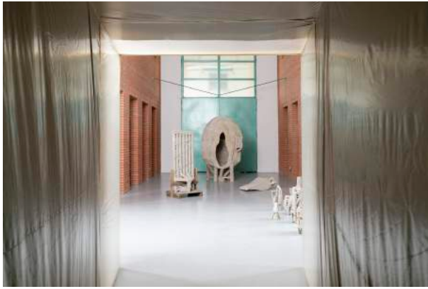
Rebecca Digne, A perdere , 2018 Set of three new sculptures from the A perdere series, 2017 Ceramic, sand, rope, wax