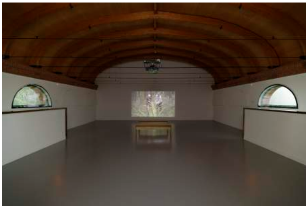
Rebecca Digne, Une aventure , 2018 Digitally transferred Super 16 mm film / Colour / Sound Coproduction Centre international d'art et du paysage and Sertis